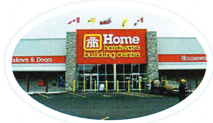
• DUNNVILLE •