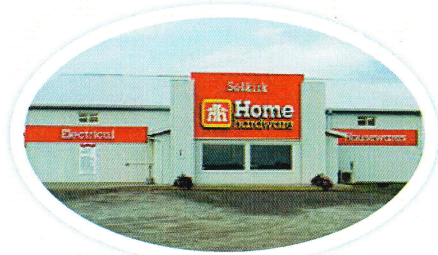
• SELKIRK •