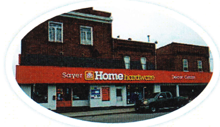
• HAGERSVILLE •

hamlets, and tight-knit townships will not disappoint as its welcoming atmosphere invites vacationers, travellers, and passers-by to discover all it has to offer.