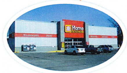
• CALEDONIA •